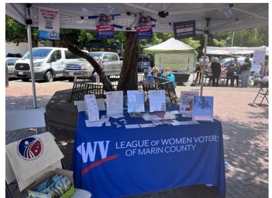
Empowering Voters and Defending Democracy one community event at a time!

We are planning to table at three events in September! Interested in engaging with the community to share voter education and League membership info? Send an email to VoterService@marinlww.org .