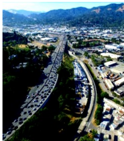
Northbound Highway 101 to Eastbound Highway 580 Connector Project